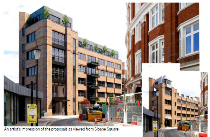
An artist's impression of the proposals as viewed from Sloane Square.

This is the office building in Holbein Place. You will recognise it from the photograph and if you have walked from Sloane Square into Belgravia, you will almost certainly have passed it. The building has been empty since the end of 2019 and Grosvenor are consulting on proposals to refurbish and carry out some minor extensions. The building is actually in the Royal Borough of Kensington and Chelsea, being on the boundary of Westminster. You will see from the photographs the main changes are to the front. There will be the slightly enhanced top floor balconies as well as window enlargement and improvements.