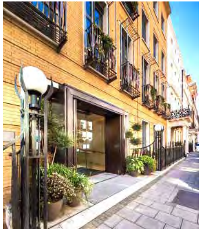
Grosvenor HQ in London – Fossil free

Our latest update has demonstrated we are already well underway, with our emissions as a business having dropped by a quarter (24%) in the last two years, almost half-way towards our 2030 target. This success is a testament to the fact we started out with the tools for success in place, from developing guidelines and processes to make our activities more sustainable and deepening our approach to collaboration with our partners and the communities we work with.