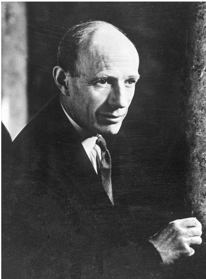
The Earl of Halifax in 1947