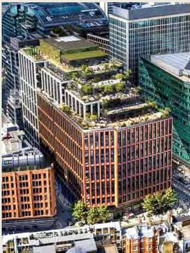
CGI of new building

Contractors Erith Group have been appointed to start the enabling stage of works on site. They are due to receive vacant possession of the House of Fraser in August 2022. By the time you read this magazine it will have closed. Works will commence with the usual site set up, investigation surveys and with hoarding and scaffolding shortly afterwards.