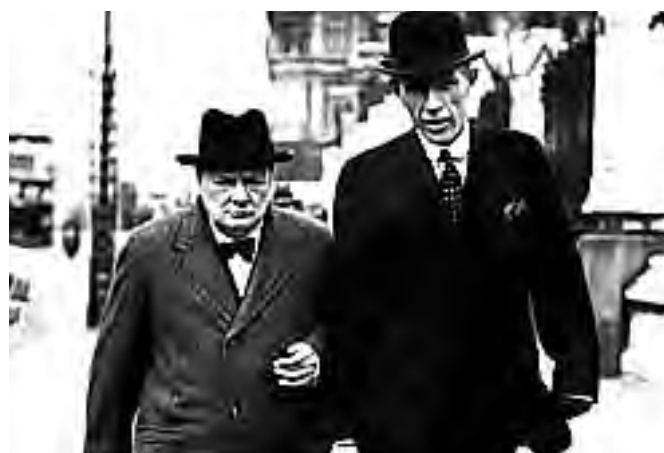
The Earl of Halifax and Winston Churchill in 1938

This the first in a series of in-depth articles on Belgravia Blue Plaques. If you would like to suggest other people commemorated by a Blue Plaque in the area, please let us know.