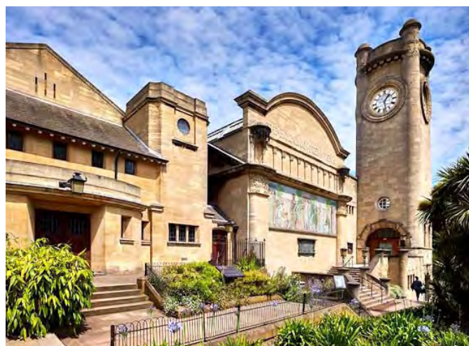
Horniman Museum and Gardens

During 2021, following a period of reflection prompted by the COVID-19 pandemic, climate emergency and other geopolitical issues, the Museum's curators reimagined the role so they could be a creative hub for their local community. The result was a transformational Reset Agenda – an ambitious programme focused on re-orientating activity to reach diverse audiences more representative of London, and encouraging young people's interests