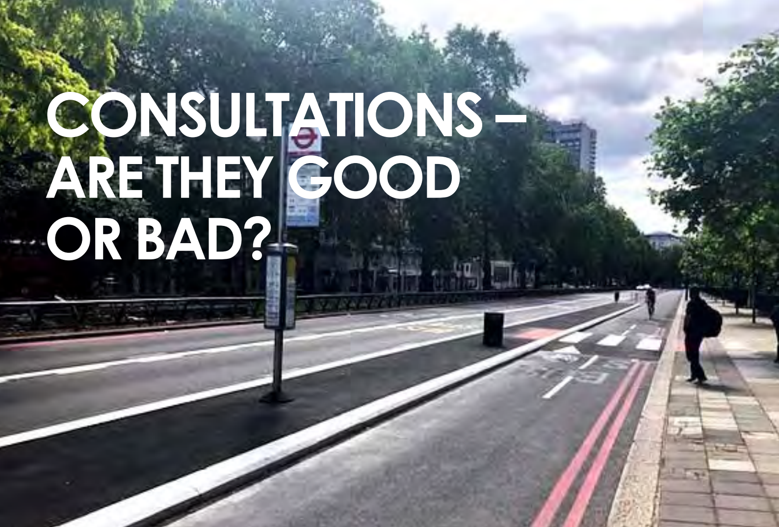
Park Lane cycle lane

In our Magazine two months ago, we questioned whether consultations are really helping to guide public authorities or developers and the like, or are they simply tick box exercises where outcomes are already decided. We hear of complaints of “loaded questions”, inadequate space for real opinions. Are the consultations with the right people? Are enough people or too many consulted? Are the right cohort of consultees being asked to reply?