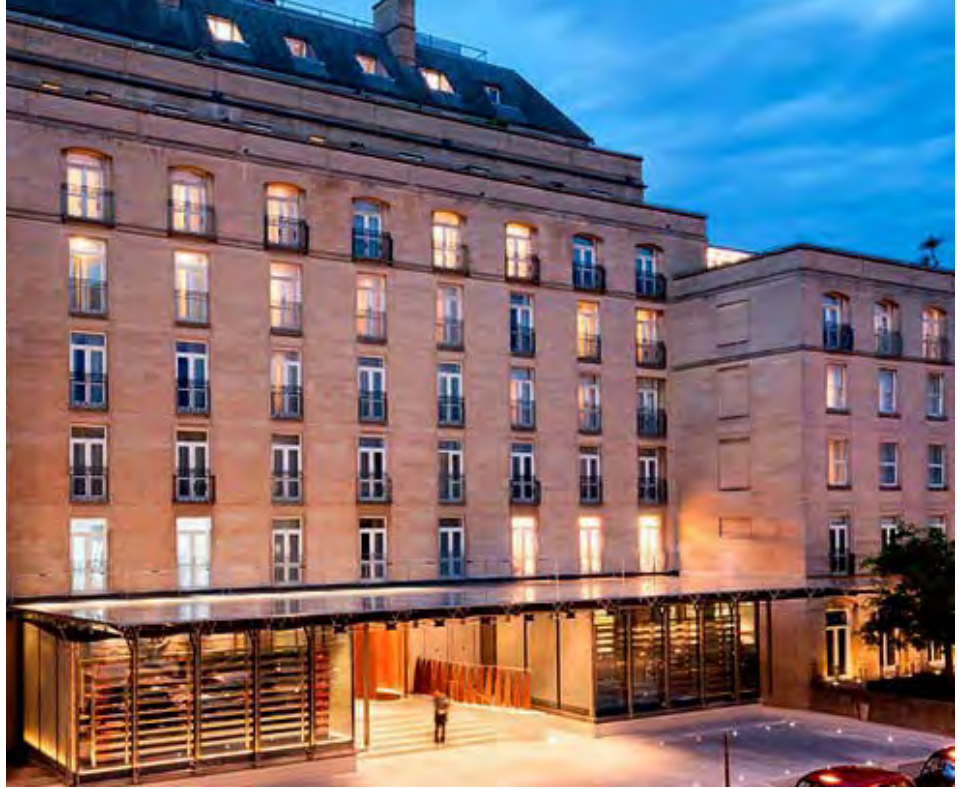
The Berkeley Hotel