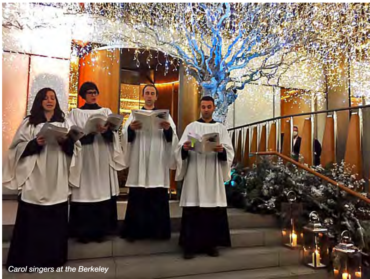
Carol singers at the Berkeley