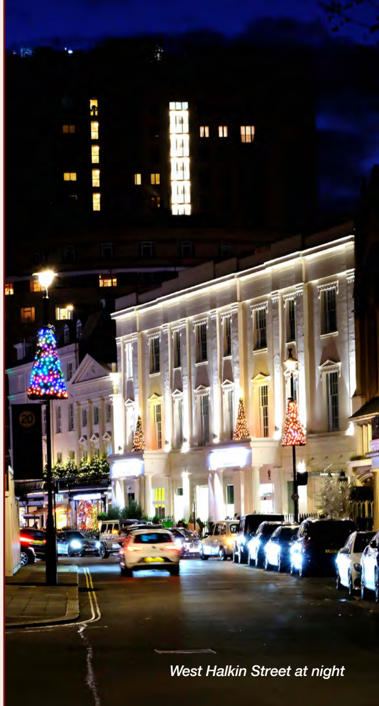
West Halkin Street at night