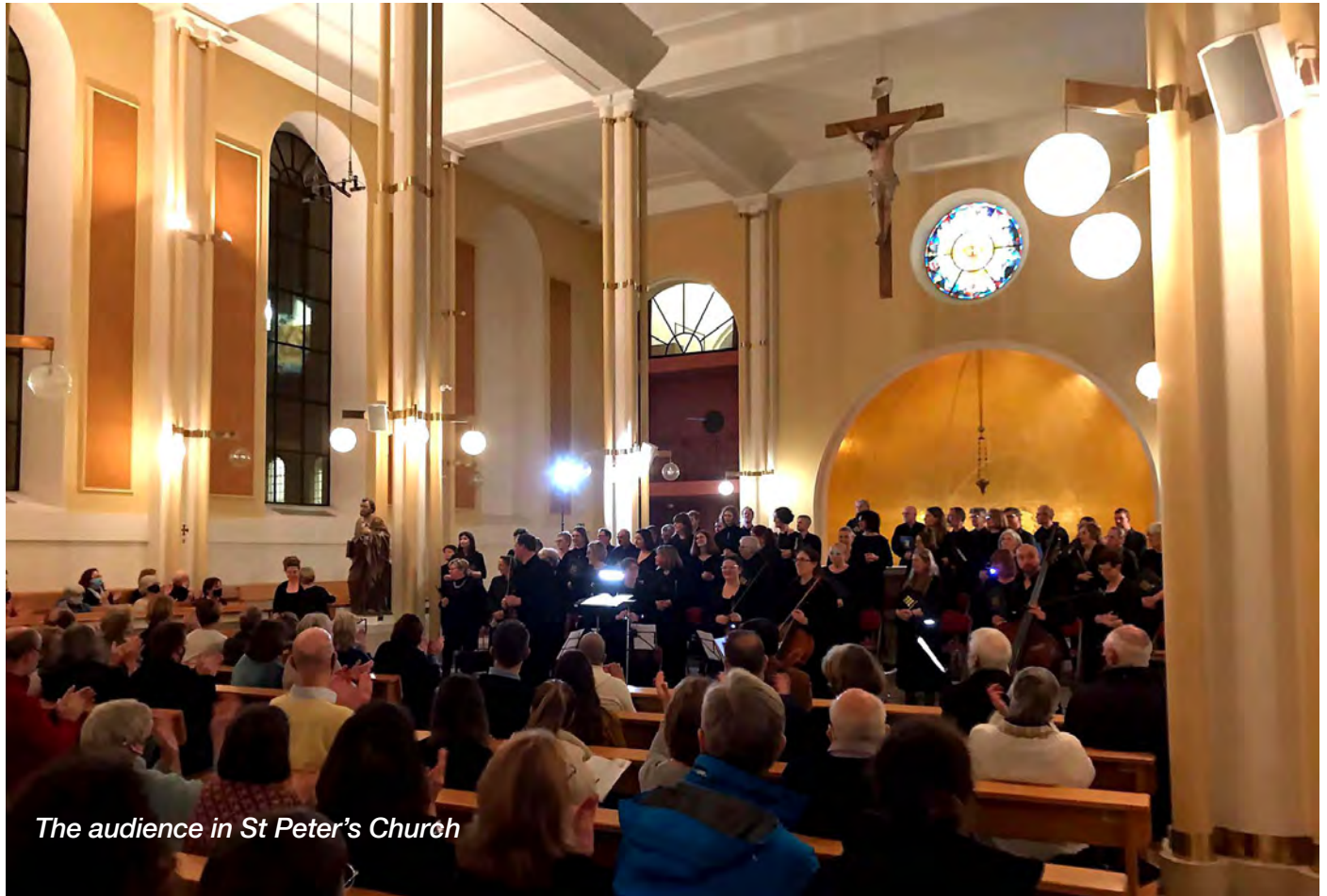
The audience in St Peter's Church

T he Whitehall Choir is a registered charity and on November 18th 2021 they gave their first performance to a live audience since Christmas 2019. Throughout lockdown the choir has embarked upon a rigorous routine of online practice sessions.