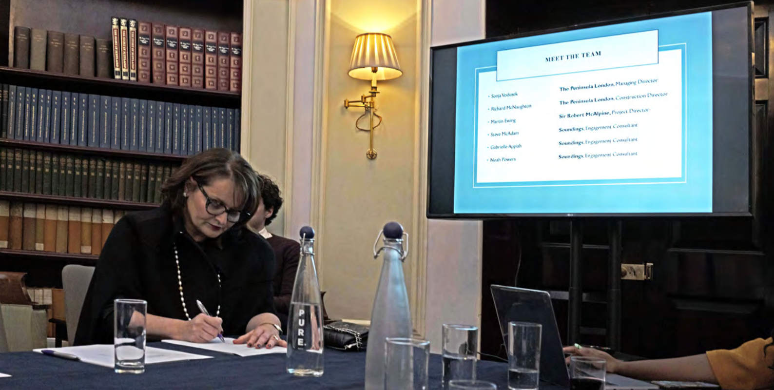
Meeting of the Peninsula Liaison Group