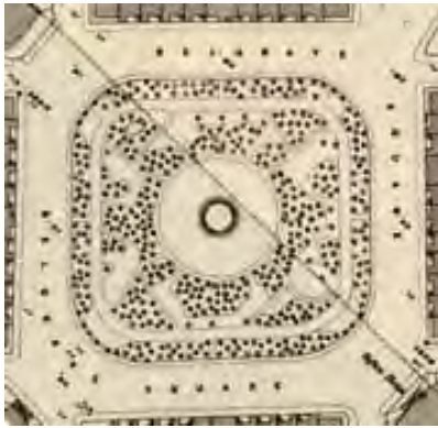
Maps of Belgrave Square from 1900 and 1950. Belgrave Square and Eaton Square were not originally designed to include tennis courts