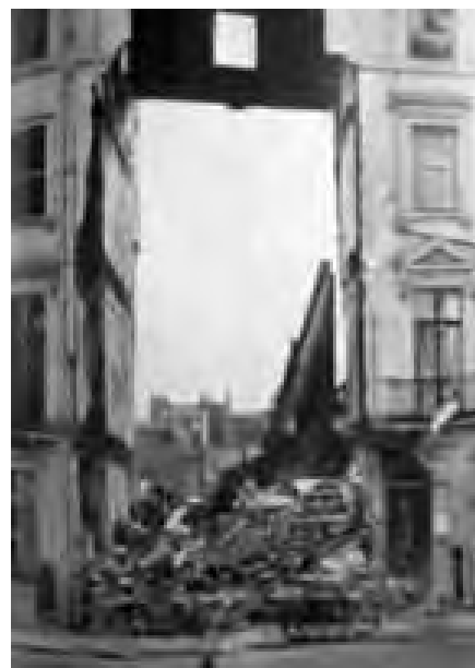
Bomb damage in Belgravia. Left: Eaton Square. Middle: 103, 105 and 107 Eaton Terrace. Right: 12 Lowndes Street. Images not too dissimilar to the recently collapsed houses at Durham Place in Chelsea